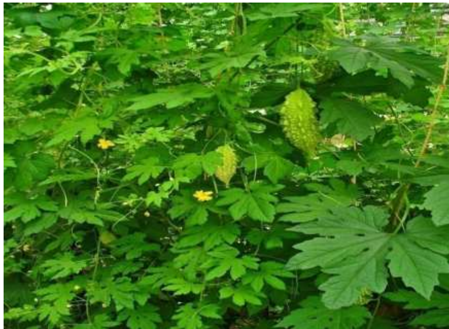
Plate 1. Momordica charantia L.