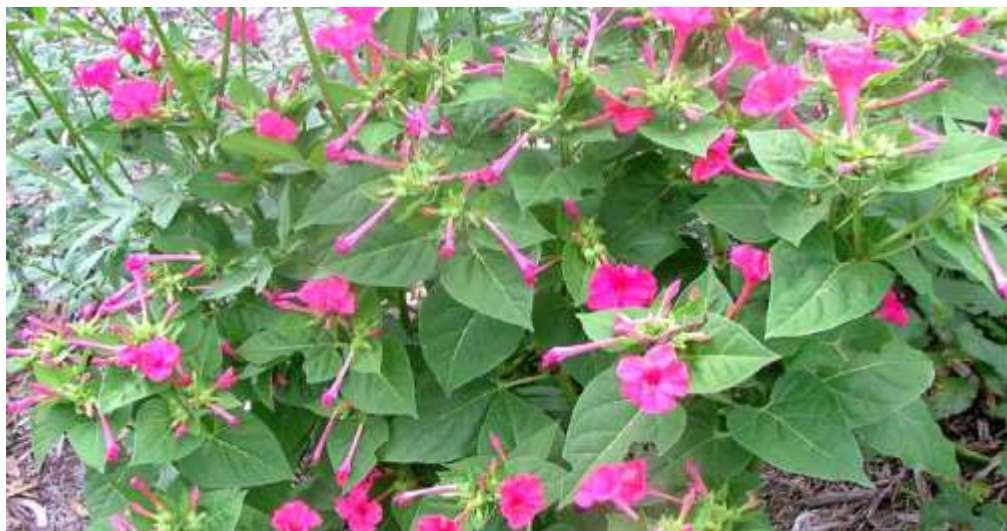
Plate 2. Mirabilis jalapa L.

glycosides, sterioids, flavonoids and tannins (Sofowora, 1993; Trease and Evans, 1986).