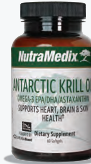
ANTARCTIC KRILL OIL 1 soft gel (better after meal)