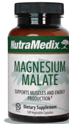
MAGNESIUM MALATE 2 capsules

*For maximum support, take Burbur Pinella every 15 minutes for 1-2 hours.