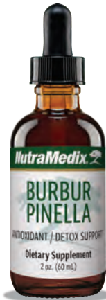
BURBUR PINELLA 15 drops