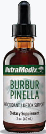
BURBUR PINELLA 15 drops