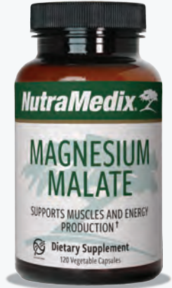
MAGNESIUM MALATE 2 capsules