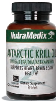
ANTARCTIC KRILL OIL 1 soft gel (better after meal)