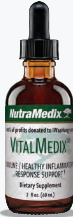
VITALMEDIX 30 drops