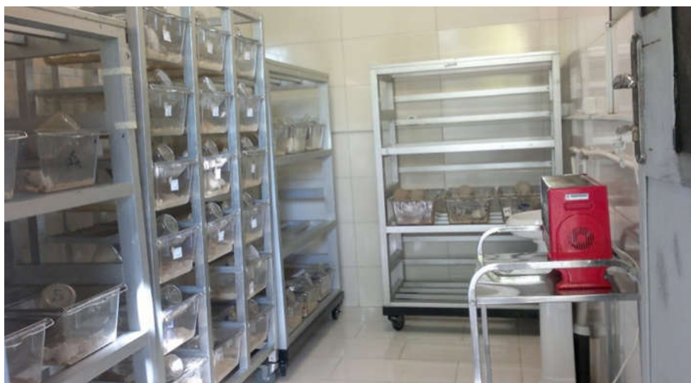
Fig. 1. Animal room of the faculty of basic sciences, Azad University of Nishabur

The mice were randomly placed in cages in order; to study anxiolytic effects of aqueous extract of V. officinalis and compare with buspirone, the mice were randomly assigned to 5 groups of 6 after 10 days. List of the treatment group and its corresponding experimental design has been depicted in Table 1.