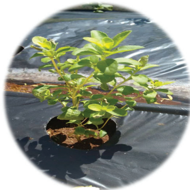
FIG. 2. Stevia rebaudiana Bertoni. Perennial herbaceous plant belonging to the Asteraceae family, originating from the spontaneous flora in the semi-arid habitat of the mountainous slopes of Paraguay. Color images available online at www.liebertpub.com/jmf

Besides steviol glycosides, SR has more than 100 phytochemicals and other compounds with antioxidant and medicinal properties. 48 The leaves have a complex mixture of compounds, including diterpenes, labdabos, triterpenes,