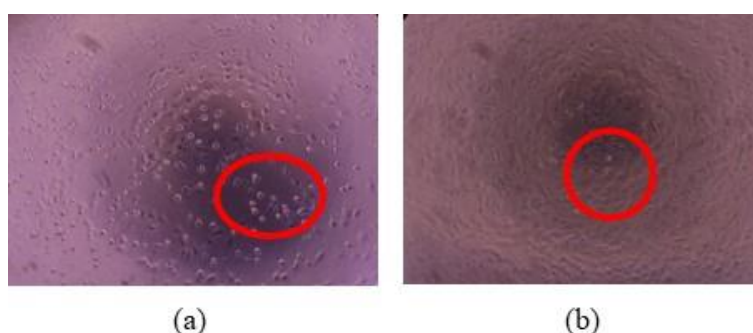
Figure 2. Effect of fraction 4 treatment on T47D cells. (a) Normal cells, (b) 5 µg/mL.